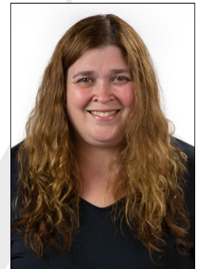
Charlotte Chase Solutions Integrator