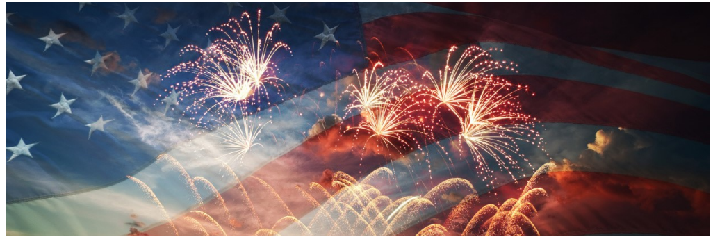
"Where liberty dwells, there is my country." -- Benjamin Franklin. Happy Fourth of July!