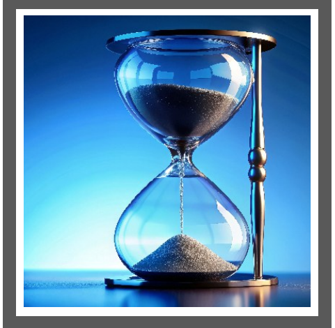
You Need to Upgrade to Windows 11... The Sooner the Better

October 14th will be here before you know it, and when that happens, Windows 10 will no longer be safe to use. Without extreme and expensive measures in place, almost every threat will have nothing to stop it.